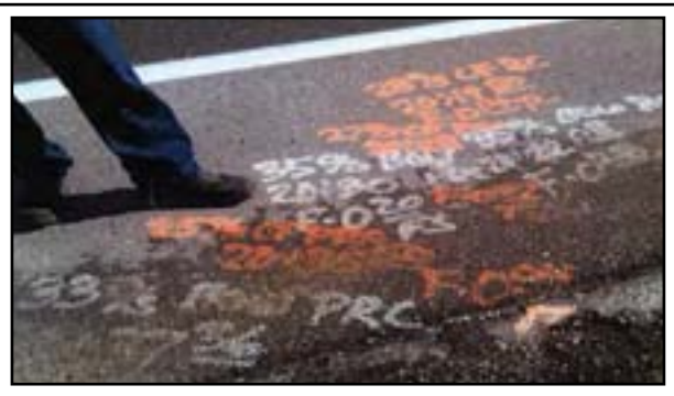
What were they thinking?

Interviewer: Honesty? I think honesty is a strength! Applicant: I don't give a #%%@! what you think!